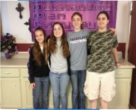
Youth Group Crockett, TX

Hello from Shepherd's Inn...my April, May and June calendar is missing churches to feed us on Saturday nights...Here's an idea that has worked just recently...pre-make the meal and deliver it to me on Friday...That works well (although we do miss seeing your wonderful faces) but with all the different schedules of everybody this has proved to work very well...please contact me or Shepherd's Inn (409-736-3980)...Thanks in advance